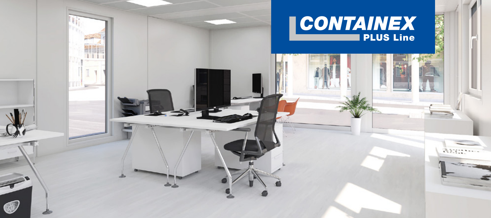
→ Attractive office interior with many design variants