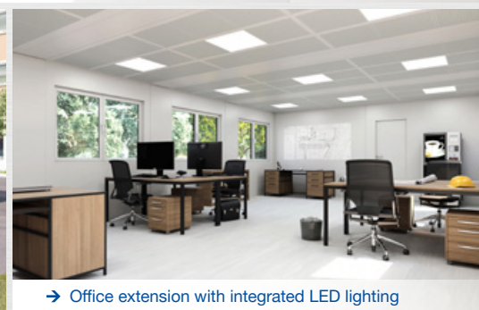
→ Office extension with integrated LED lighting