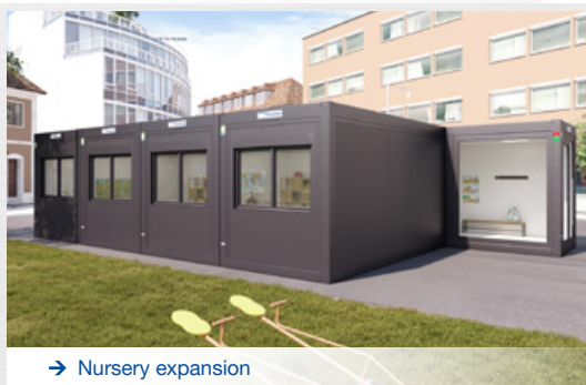
→ Nursery expansion