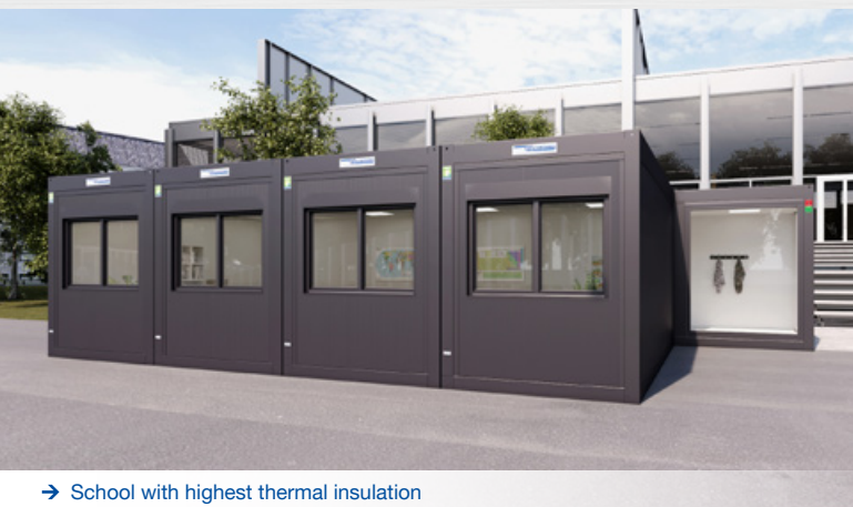
→ School with highest thermal insulation