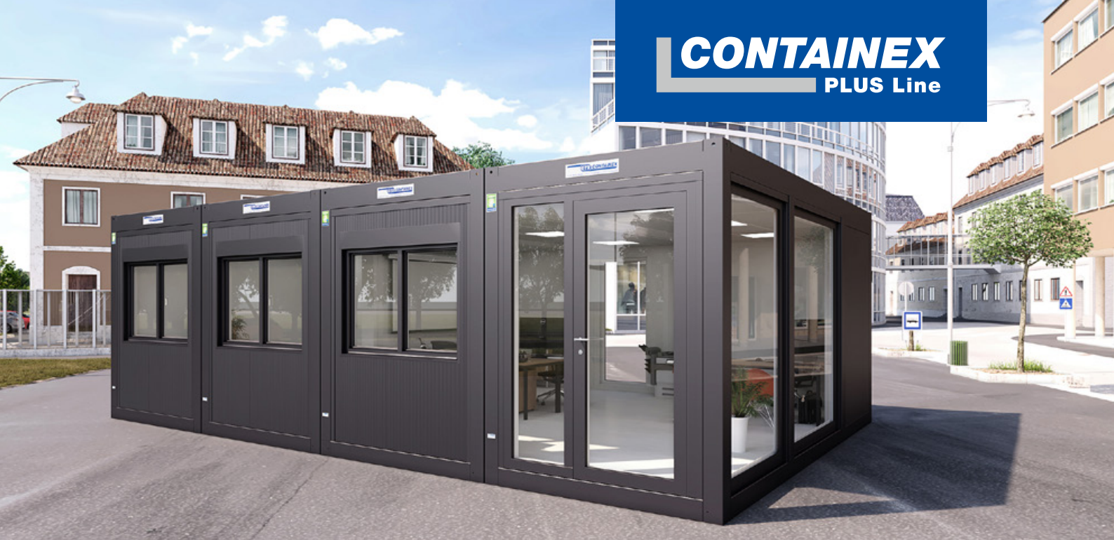
→ Office in attractive anthracite grey