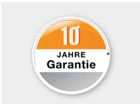
Warranty on Hörmann sectional doors