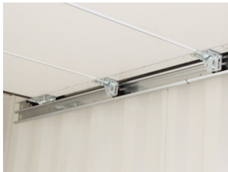
Low height from top of door to roof