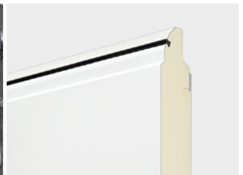
Double-walled steel panels