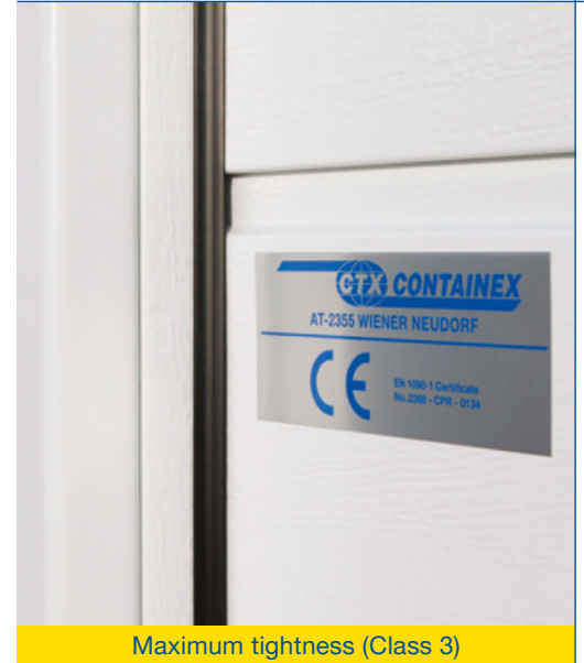
Maximum tightness (Class 3)