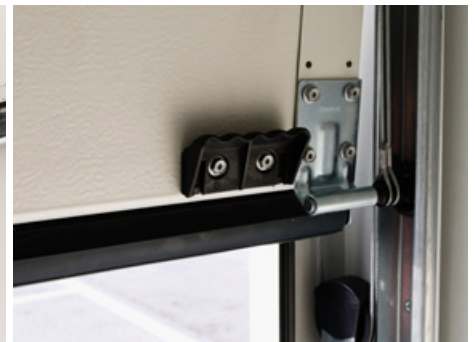
High-quality guide rail