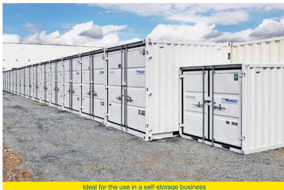
Ideal for the use in a self-storage business