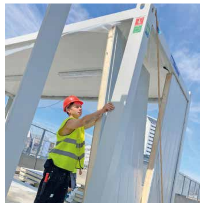
Panels 100% compatible