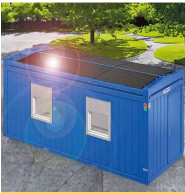
Available for CONTAINEX CLASSIC and PLUS Line