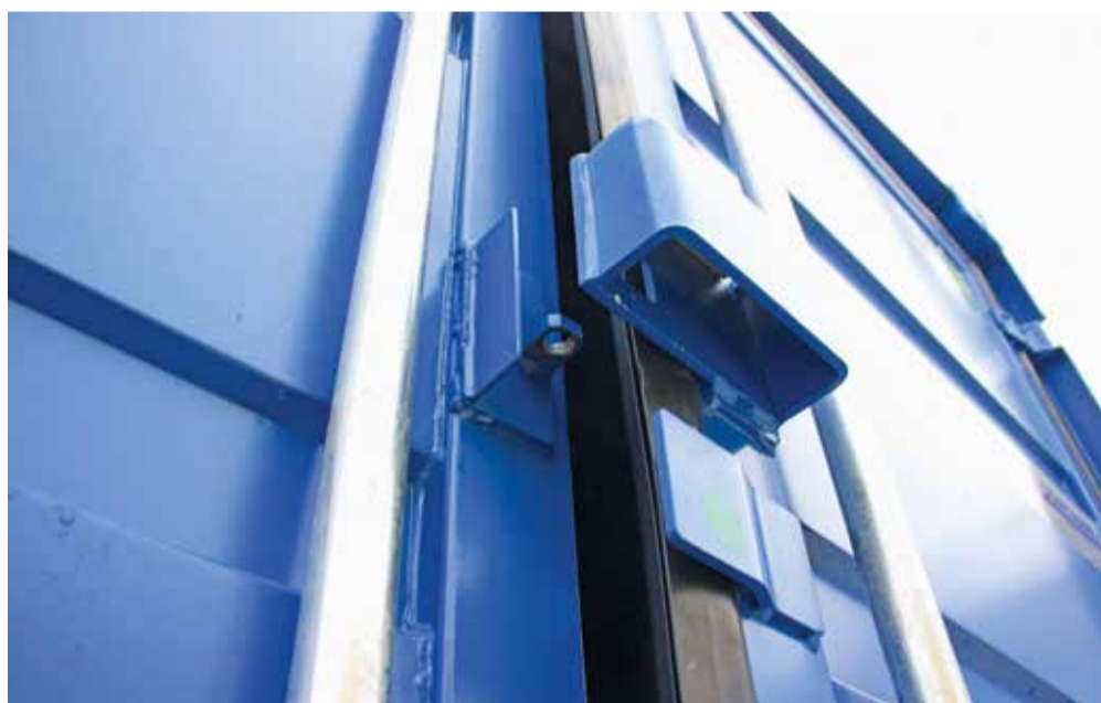
Bracket for padlock