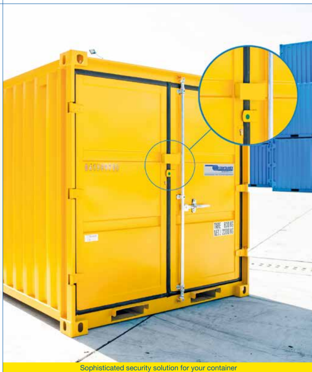
Sophisticated security solution for your container

The break-in protection made of robust, 6 mm thick construction steel is welded directly on to the double wing door at the factory. With paintwork in the desired colour from the CONTAINEX RAL chart, the lock box fits seamlessly into the overall appearance. A combination with our comprehensive security fittings is also possible. This means maximum protection for your storage container!