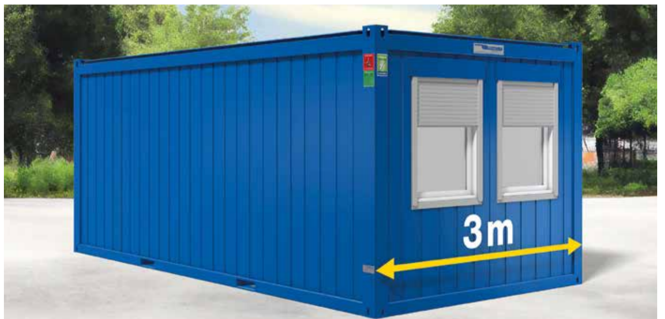
New CLASSIC Line XL module

Our all-rounder for any purpose - the CONTAINEX CLASSIC Line – now available with a width of three metres! This not only creates an „airy“ sense of space, but also 20% more space per module. This allows us to offer you even more flexibility in the planning and use of space solutions of any size in proven CONTAINEX quality. The CLASSIC Line XL is also fully compatible with all panels and spare parts, so you do not have to make any compromises.