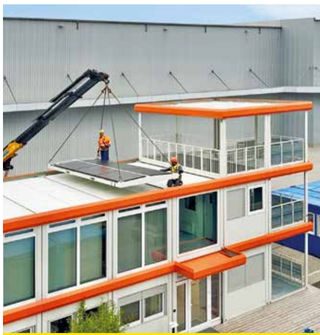
Handling with crane or fork lift