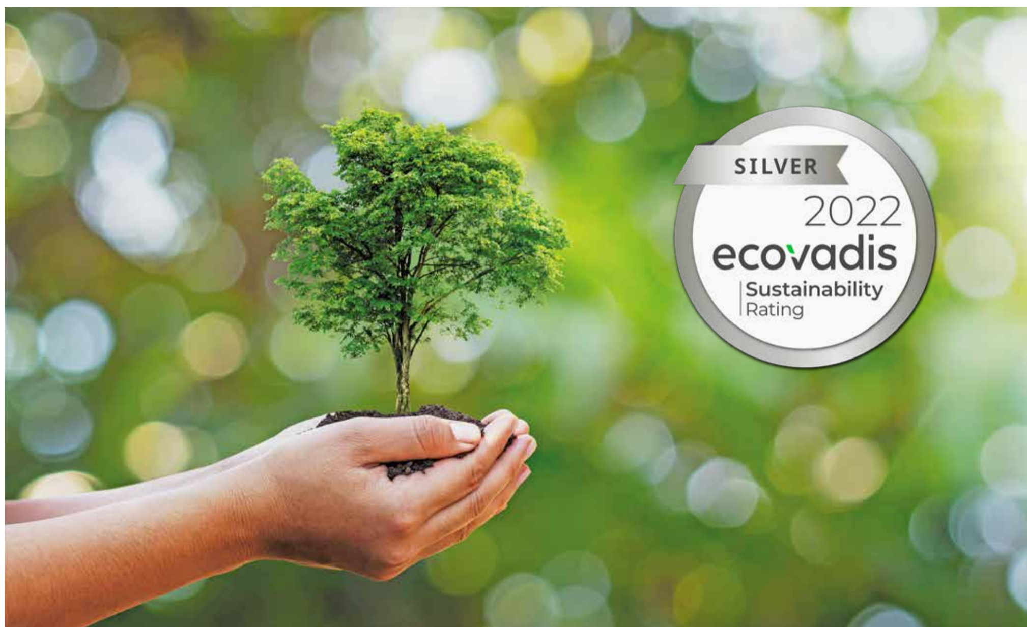
Our award-winning contribution to a more sustainable future

– CSR“, these values are the basis for long-term professional partnerships. In order to make these values visible, CONTAINEX has been evaluated by the global CSR rating agency EcoVadis. The result is a great award for the whole team!