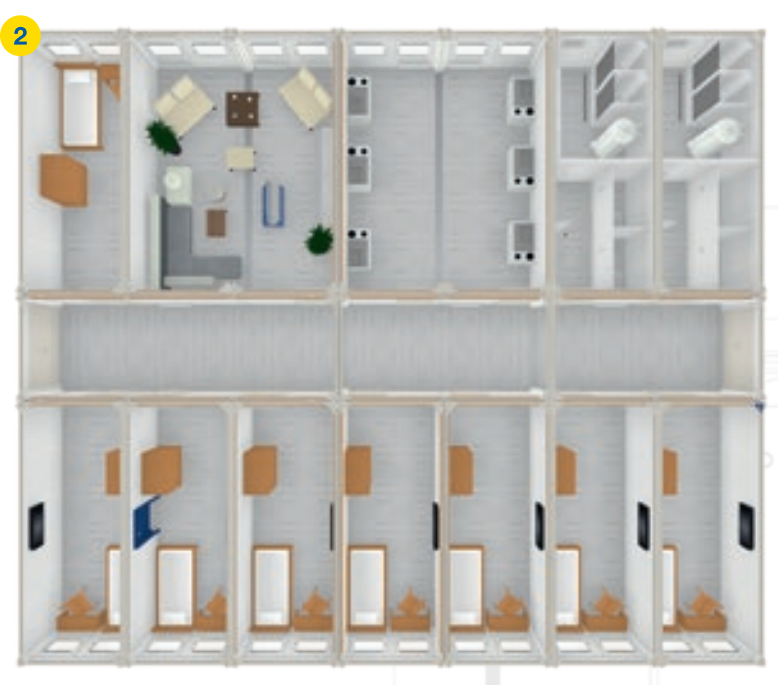
12x BM 20' + 1x BM 24' + 2x BM 16' + 2x SA 20' ⊟I ~221 m<sup>2</sup>

4x BM 20' + 1x BM 24' ⊟⊺ ~68 m<sup>2</sup>