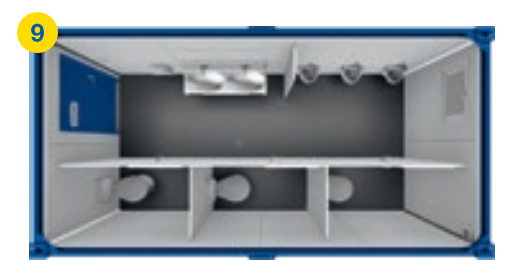
1x SA 16' ⊟ī ~11 m²

1x SA 20' + 3x BM 20' ⊟I ~53 m<sup>2</sup>