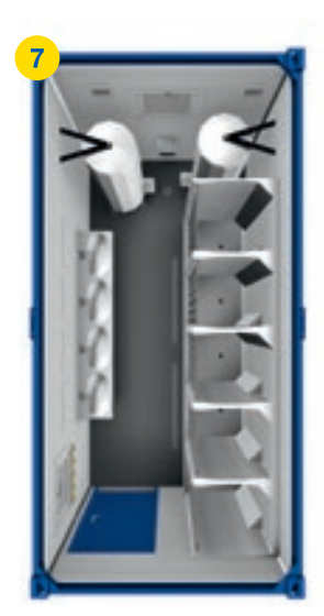
1x SA 20' ⊟I ~13m²