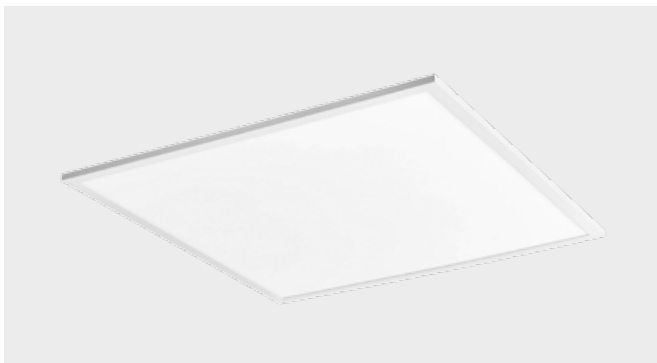
Pannello LED (27 W)