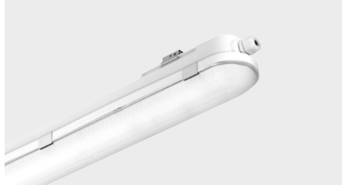
Plafoniera a LED (36 W/43 W)