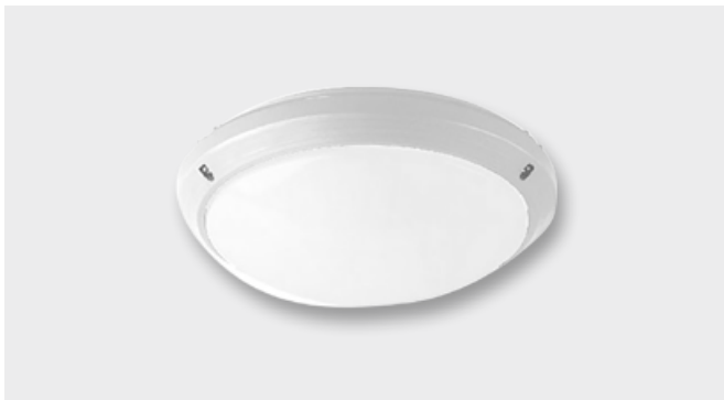
Punto luce LED (8 W)