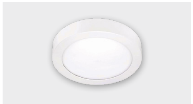
Lampada a LED rotonda (17 W)