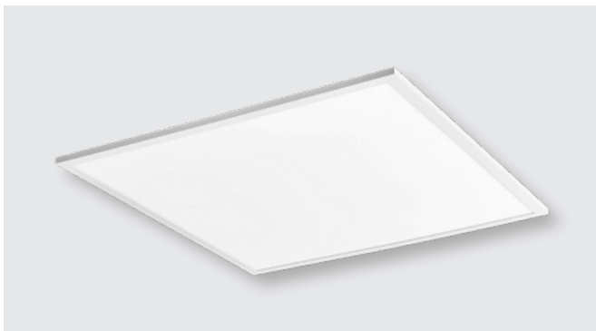
Led-paneel (27 W)