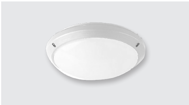
Volledig glazen led-lamp (12 W)