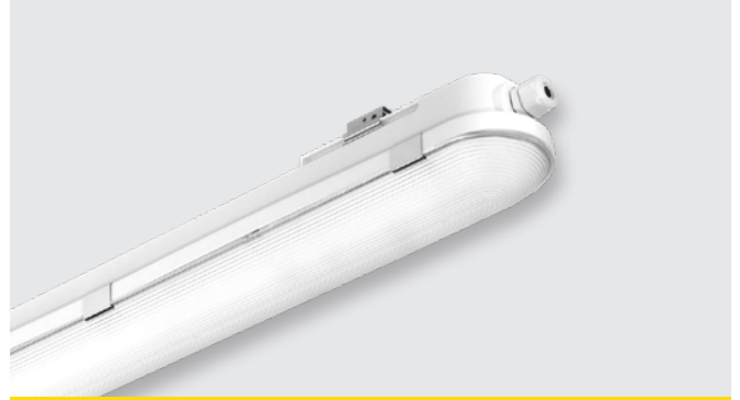
Inbouwlamp LED (36 W/43 W)