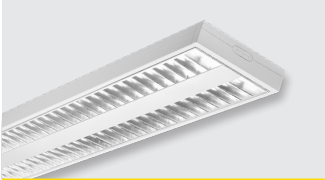
Spiegelframe lamp met led's (50 W)