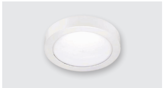
Led-rondlicht (17 W)